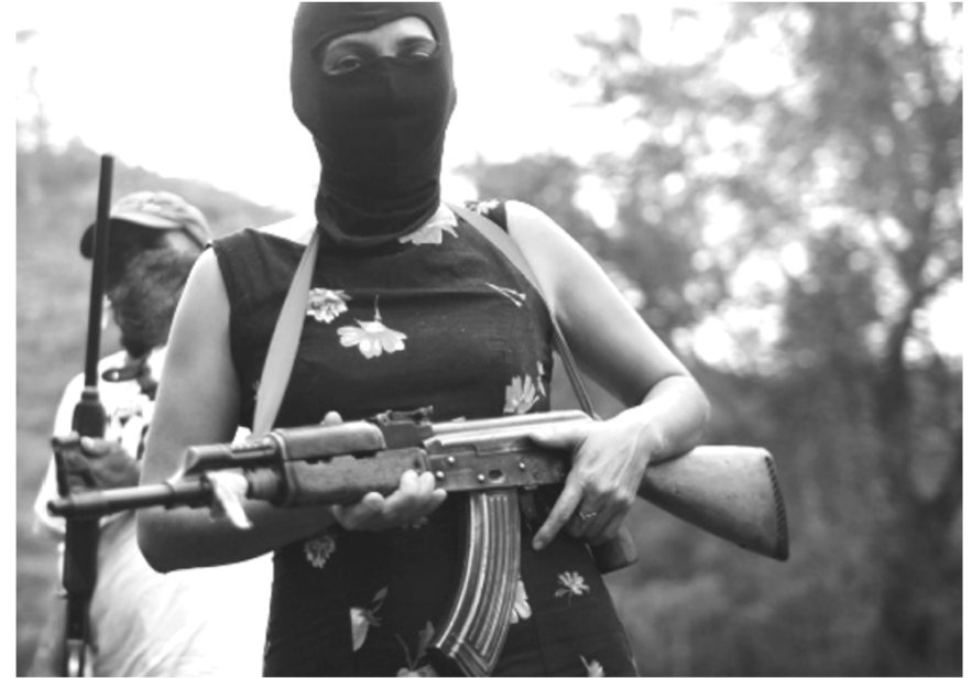
Community members take up arms to protect themselves from the drug cartels and corrupt police in Michoacán, Mexico.

The comunitarios in Peribán have an intergenerational element to them that has all but been lost in most Mexican mestizo communities. Elders and young men have collaborated with one another to create a self-defense team that is respected by community members. I also met three young men from an outside community who had embedded themselves in Peribán for the long haul. These three young men were no younger than eighteen and no older than twenty-five years old. They have been on the front lines of the battle for self-defense for just over a year now and have become experts in security and in hunting down and assassinating Templars. These three young men left a lasting impression on me. Despite having lost friends and family and then growing into respected and trained killers, they have not lost their humanity. How does anyone live through what they have and not lose their sense of humanity? This is a quality I expect to rarely find among young men with assault rifles anywhere in the world.