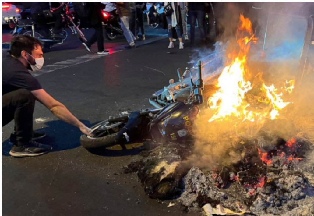
A police motorcycle is burned at a demonstration in Tehran.

In all the previous uprisings, the police were not directly the target of the ire of people. Not this time. They are the baddie this time, and people are out for their blood. This wears them down physically and mentally, which we take as good news.