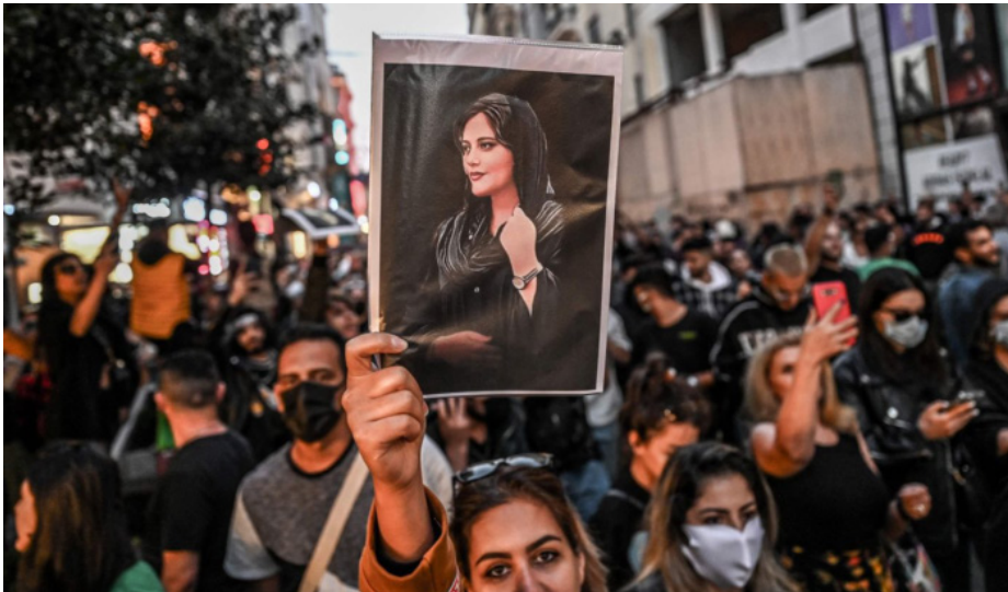
Demonstrators in Istanbul, Turkey hold up an image of Mahsa Amini.

For more updates from so-called Iran, we would recommend following the media of The Federation of Anarchism Era https://asranarshism.com/