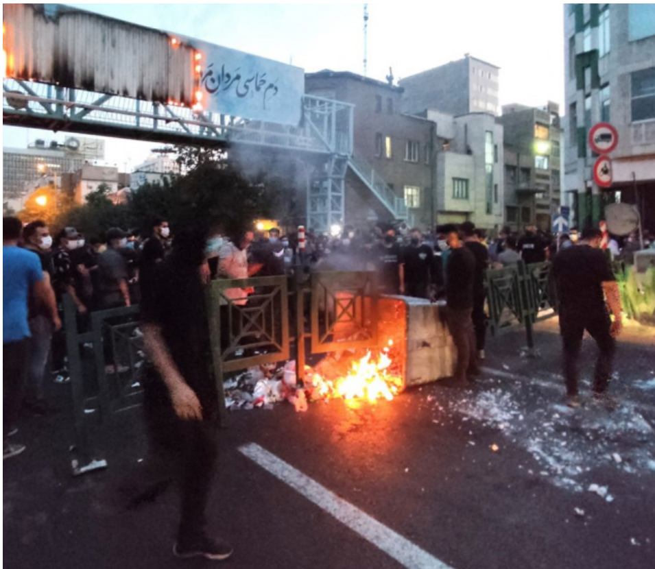
A barricade constructed at a demonstration in Tehran on 9/21/22.

First, there were small protests at Kasra Hospital, which were scattered by the police. The sparks of the current uprising were lit in Saghez, Mahsa's hometown.