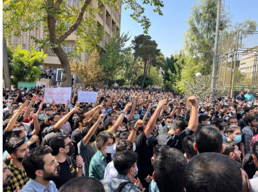
University student demonstrators in Tehran on 9/19/22

This interview was conducted between the dates of 9/20/22 and 9/23/22.